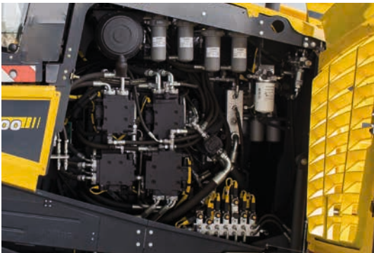
Save up to 17 % fuel – demand-driven hydraulics – with BOMAG ECOMODE.