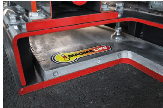
Heats up nearly 60 % quicker – unique MAGMALIFE heating system.