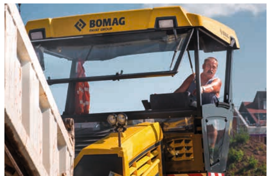
The right position in each situation – the comfortable driver's cabin.